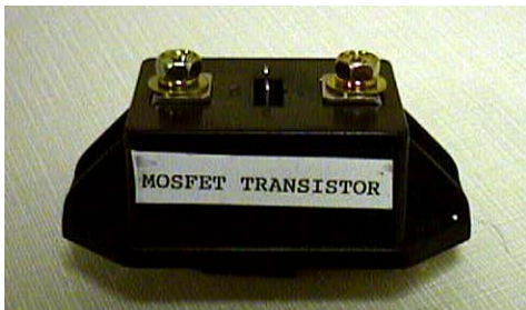
MOSFET MODULE POWER SEMICONDUCTOR DISSIPATION RATE >1 W 8541.29.00 HQ 084659