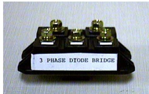
THREE PHASE DIODE BRIDGE 8541.10.00 HQ 958726 HQ 960323