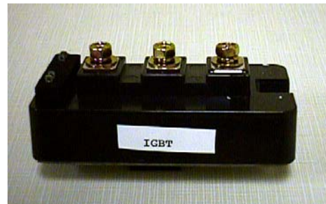
INSULATED GATE BIPOLAR TRANSISTOR MODULE (IGBT) DISSIPATION RATE > 1 W 8541.29.00 HQ 084659