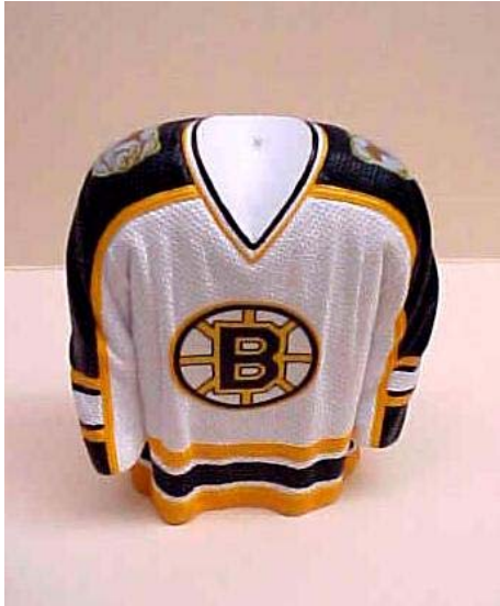
AGGLOMERATED STONE SPORTS JERSEY – 6810.99.00