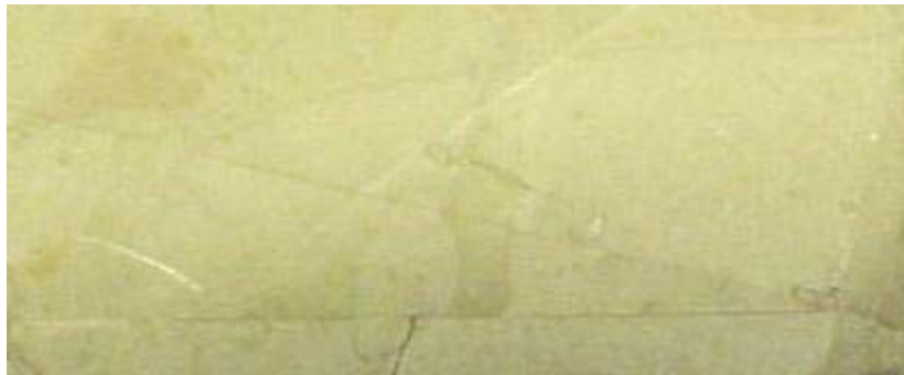
AGGLOMERATED STONE SLAB – 6810.19.50 OR 6810.99.00: DEPENDING ON WHETHER SLAB IS A BUILDING COMPONENT OF THE TYPE DESCRIBED IN 6810.19.50, OR A GENERAL PURPOSE STONE PIECE (6810.99.00) USED EITHER AS A COUNTERTOP OR AS A BUILDING COMPONENT