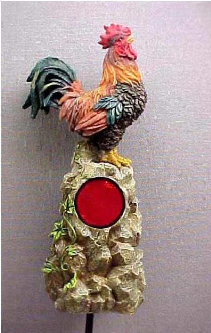
AGGLOMERATED STONE ROOSTER – 6810.99.00