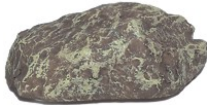
ARTIFICIAL ROCK OF AGGLOMERATED STONE USED TO HIDE KEYS – 6810.99.00